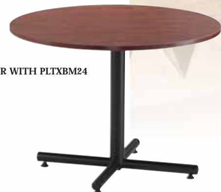
PLT42R WITH PLTXBM24

Top Finishes In-Stock: Cherry-CH, Mahogany-MH Gray Speckle-GN Base Finish In-Stock: Black