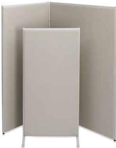
Available in Grey Fabric with Mist Grey Frame

Create a quiet office with panels that are sturdy and sound-absorbing. Panels can be freestanding with optional T-Base (sold separately) or connected together to create walls, hallways and enclosed offices. Semi-tackable, grey fabric with matching powder-coated steel frame.