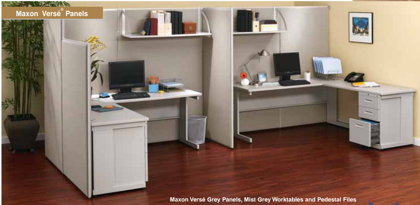
Maxon Versé® Panels