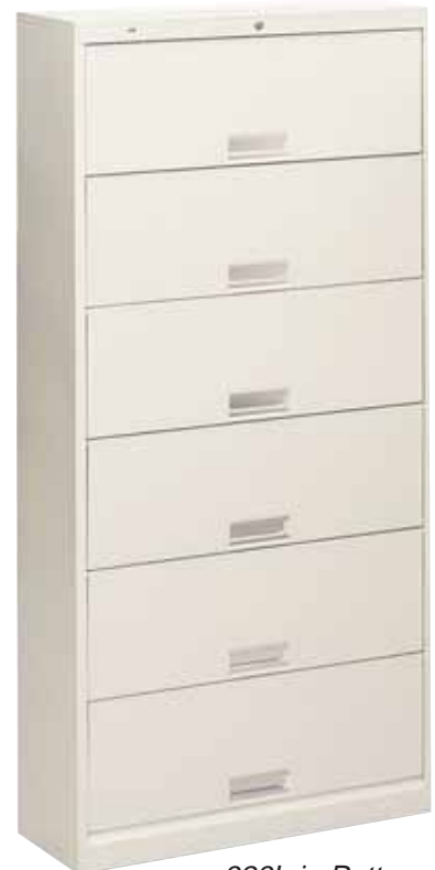
626L in Putty

With Receding Doors—Doors recede on nylon glides. "One Key" interchangeable core removable lock controls all openings. Six fixed shelves. 36"W x 13-3/4"D x 75-7/8"H 626LL Putty 626LQ Light Gray .....$1041.00