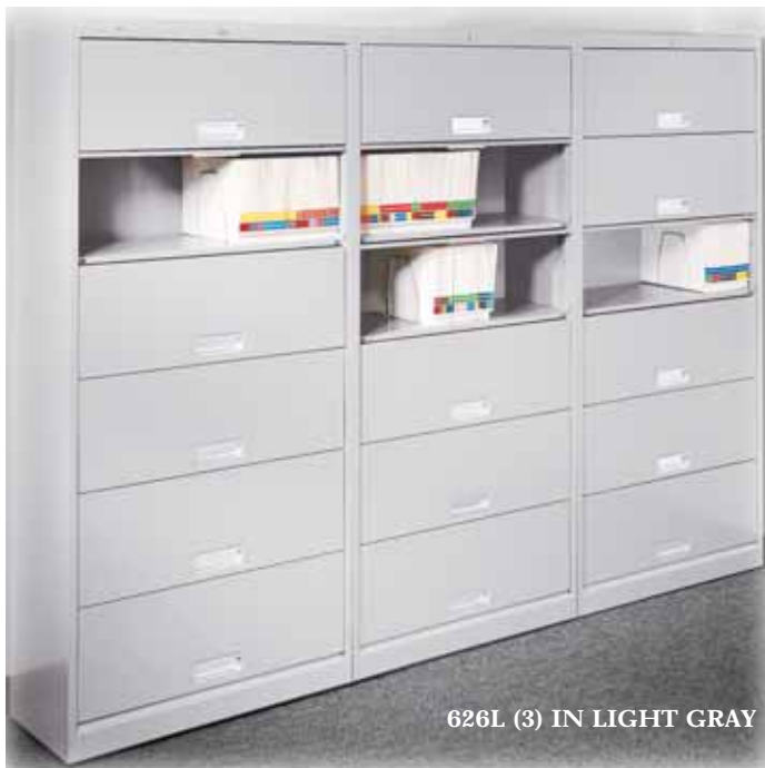
626L (3) IN LIGHT GRAY

Select items on this page stocked Nationwide. Call for details!