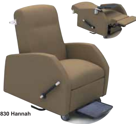
L. 830 Hannah

Three position push arm mechanism. Sinuous wire spring suspension and high density foam for durability and patient comfort. Hardwood feet offered in three finishes.